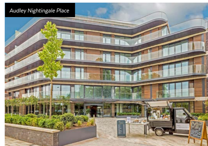
Audley Nightingale Place