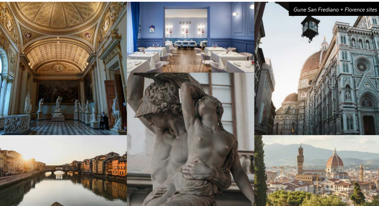
Gune San Frediano + Florence sites