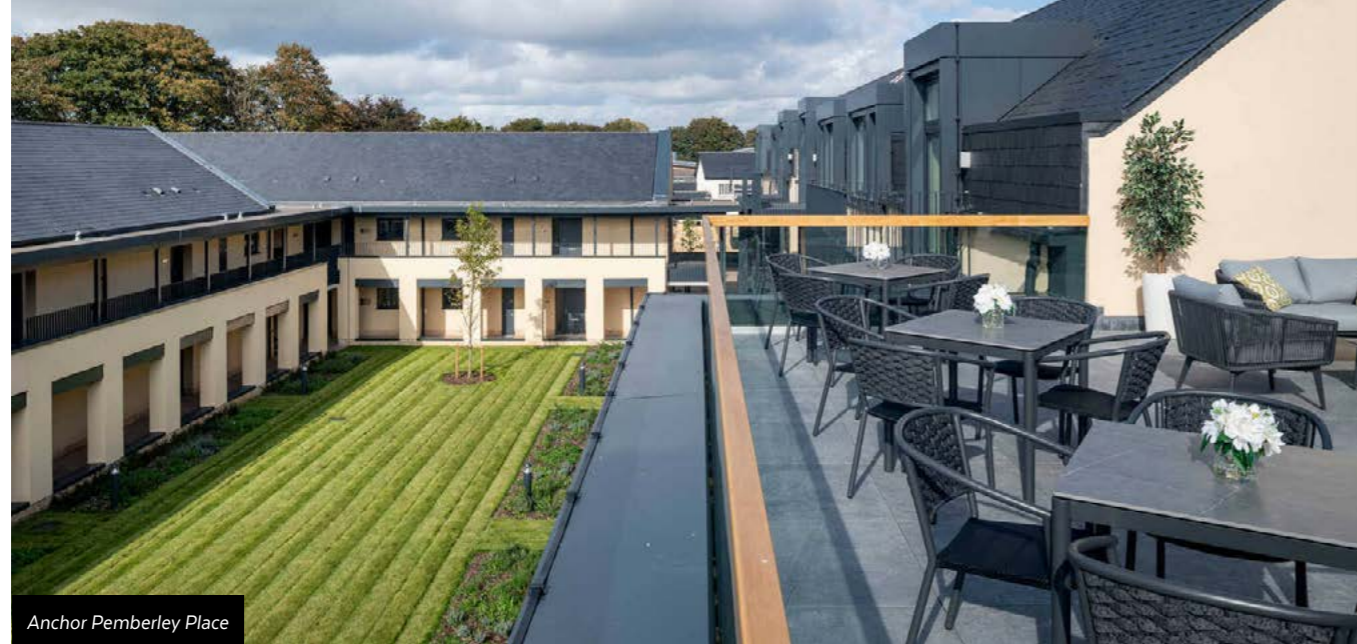
Anchor Pemberley Place