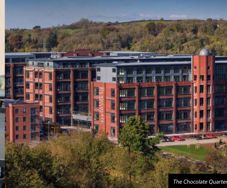
The Chocolate Quarter