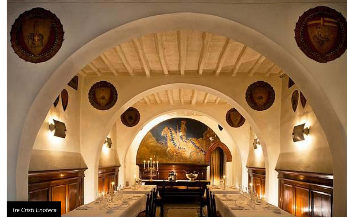
Tre Cristi Enoteca