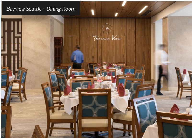
Bayview Seattle - Dining Room