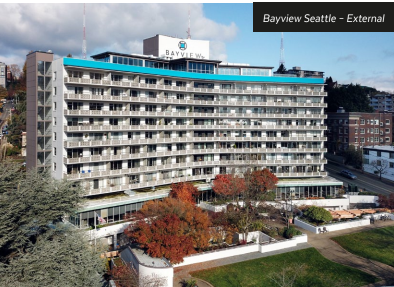
Bayview Seattle - External