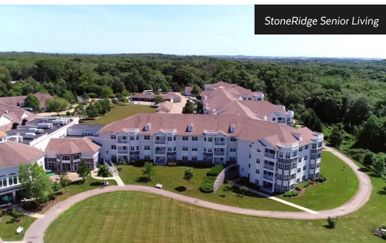
StoneRidge Senior Living

Our next stop is at StoneRidge Senior Living. StoneRidge offers assistance-in-living, assisted living, memory care, skilled nursing and rehabilitation in one of the most attractive spots on the Connecticut coast.