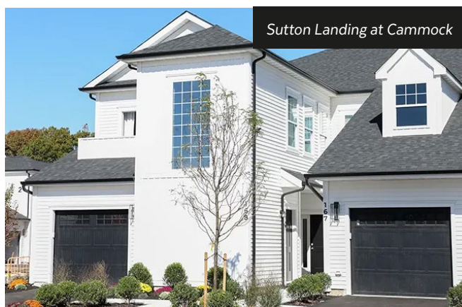
Sutton Landing at Cammock