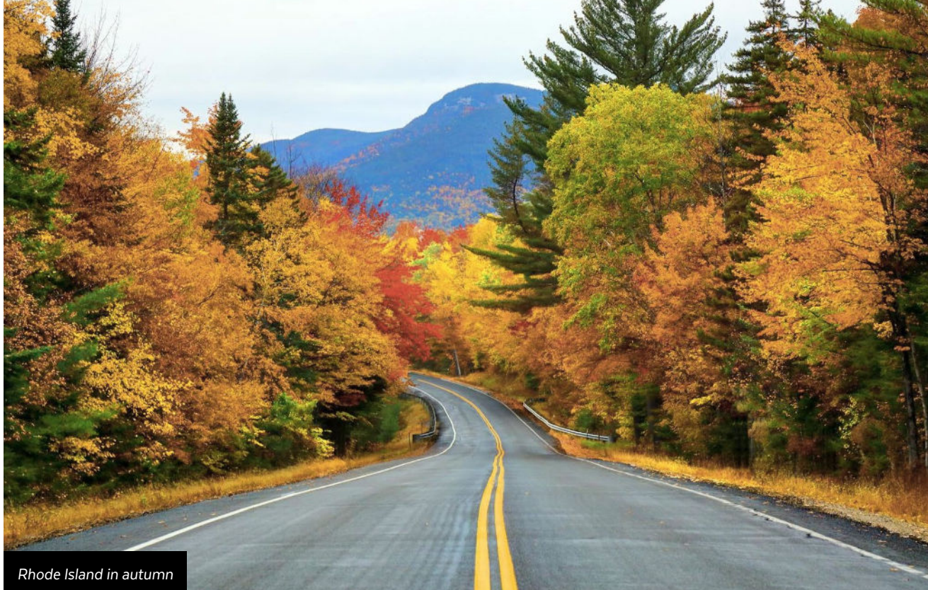
Rhode Island in autumn