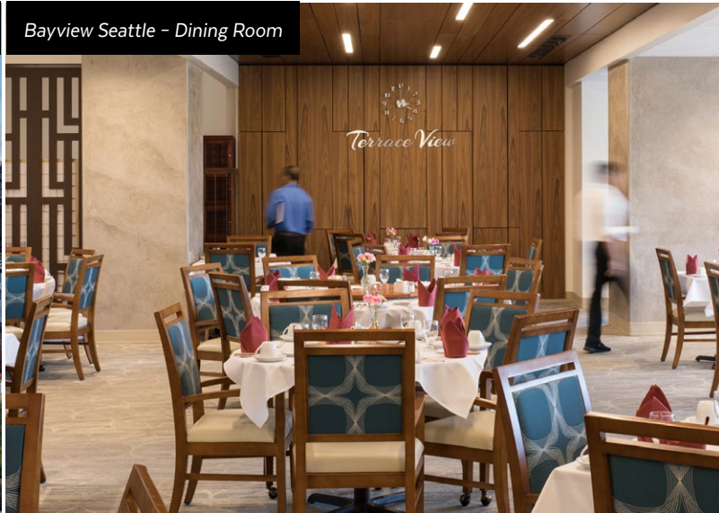
Bayview Seattle - Dining Room