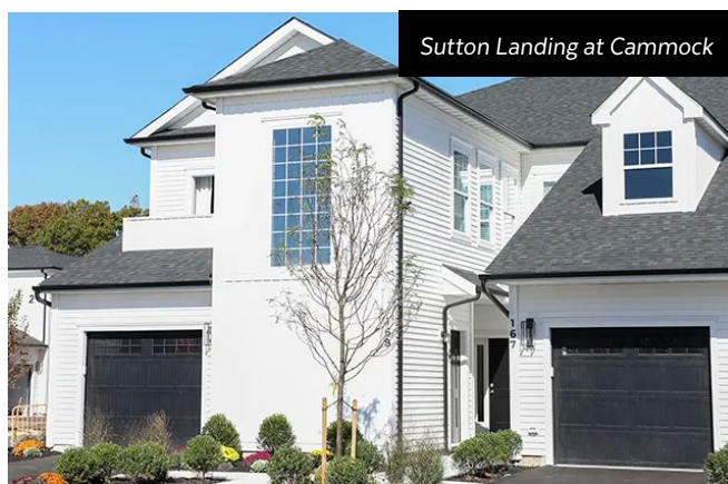
Sutton Landing at Cammock