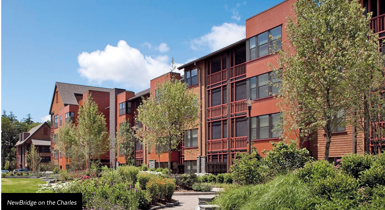
NewBridge on the Charles