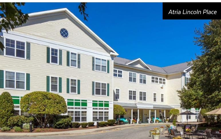
Atria Lincoln Place