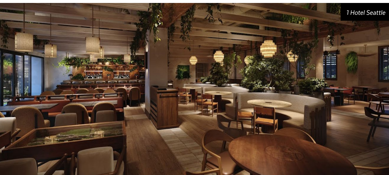
1 Hotel Seattle