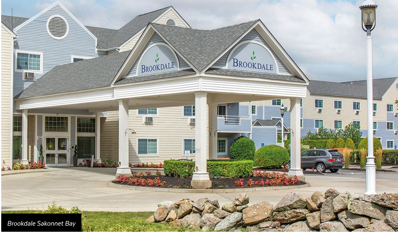
Brookdale Sakonnet Bay