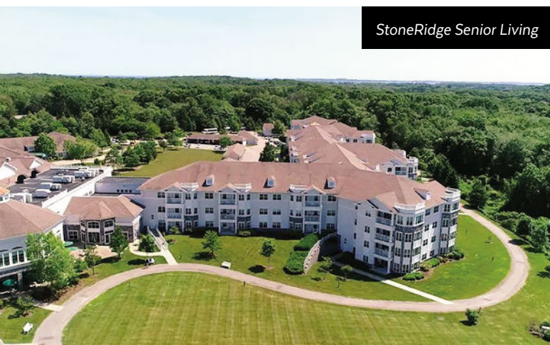
StoneRidge Senior Living

Our next stop is at StoneRidge Senior Living. StoneRidge offers assistance-in-living, assisted living, memory care, skilled nursing and rehabilitation in one of the most attractive spots on the Connecticut coast.