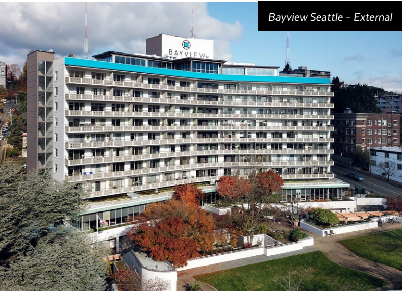
Bayview Seattle - External